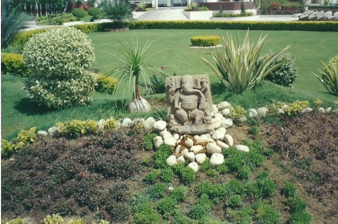
GANESH JI IDOL AT THE ENTRANCE

eyes as if it was real. All of us who were present there saw small green eyes that moved. We were all taken aback by what we saw. How could a stone idol open its eyes? We were all very shaken by the incident and when we went back to guruji, the first thing