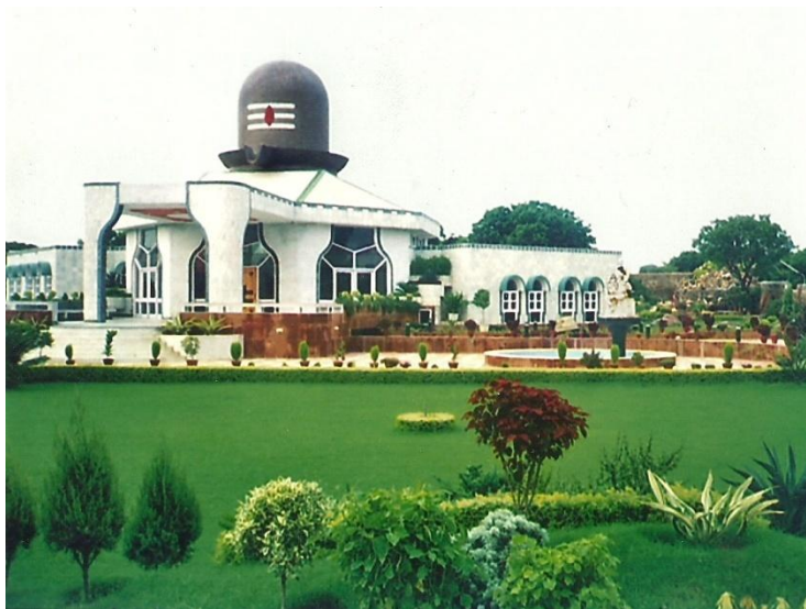
ONE OF THE EARLY PHOTOGRAPHS OF THE BADA MANDIR

there as well. “Guruji, are there any itcha dhaari snakes or is it just a